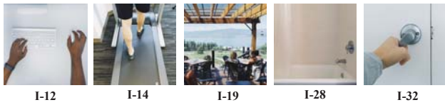
Figure 2: Sample activity images used in YADL (Indexes below)